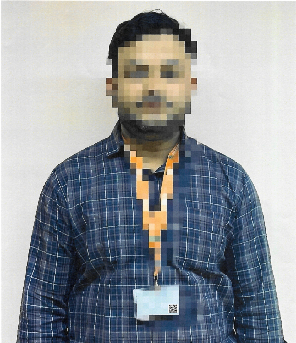
Figure 1: Sample Picture of Faculty to be uploaded While Inspection. Note: QR Code, Name and PCI Code/ Institutions must be visible in picture

All staff photo should be taken at designated place of the institution.